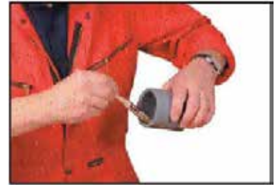
Brush applying cement of the fitting