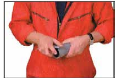
Abrading the pipe