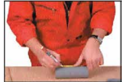
Marking the insertion depth on the pipe