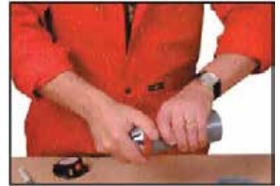
Chamfering the pipe