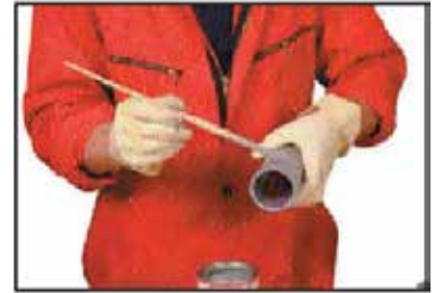
Brush applying cement of the fitting